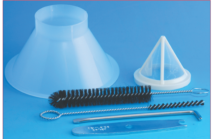
Kit contents are spray gun c/w selected air cap and tip set up, gravity cup, pouring funnel, spanner, torx key and cleaning brushes.