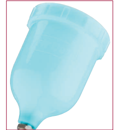
Gravity cup (Blue polyester) pt. no. GFC 511 for difficult fluids.