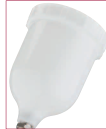
Gravity cup pt. no. GFC 501

PRi HD Gravity Fluid Tip/ Needle (.mm) size and code: 1.4, 1.6, 1.8, 2.0, 2.5.