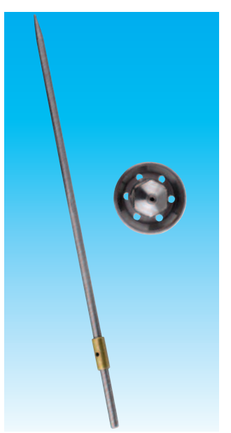
Stainless Steel fluid tip and needle as standard.