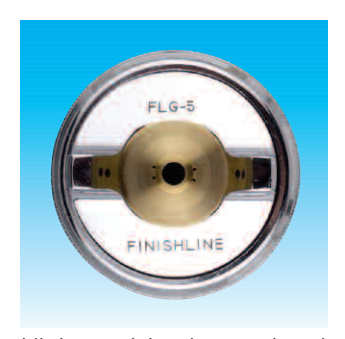
High precision brass plated air caps.