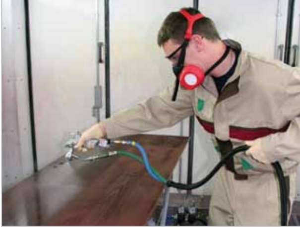
Perfect finishes are achieved with this flexible and versatile spray gun.