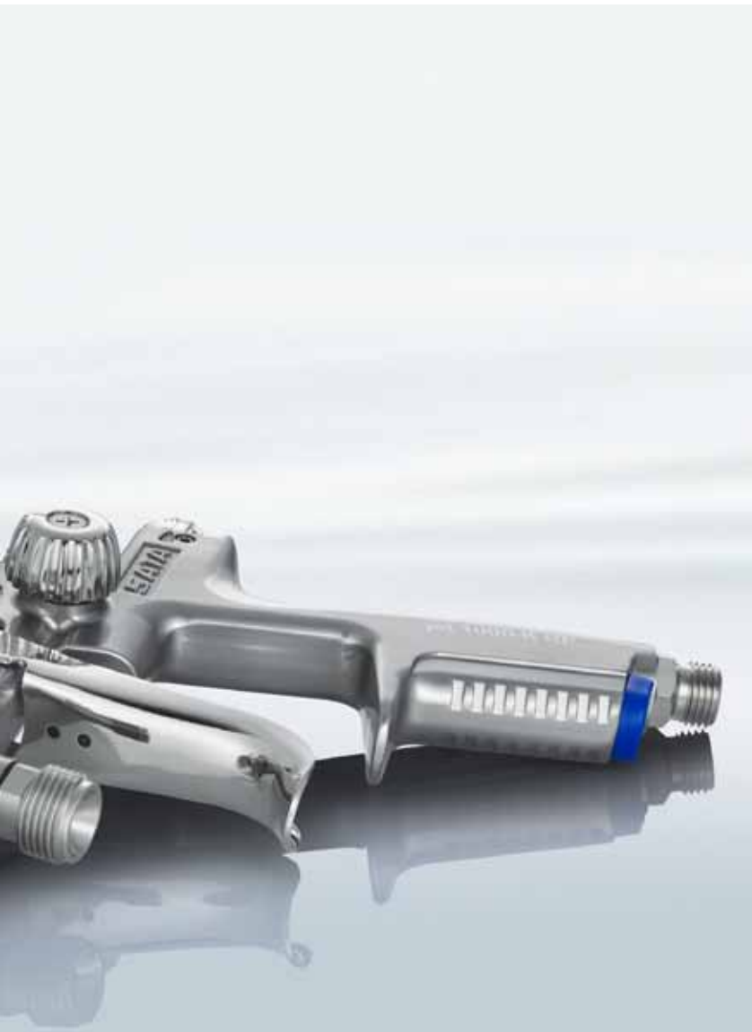
Complementary accessories are available for special applications, such as radiator coating.