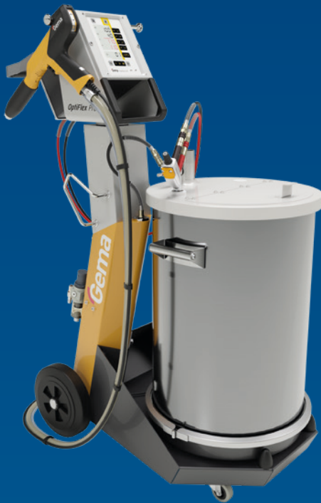
OptiFlex® Pro F