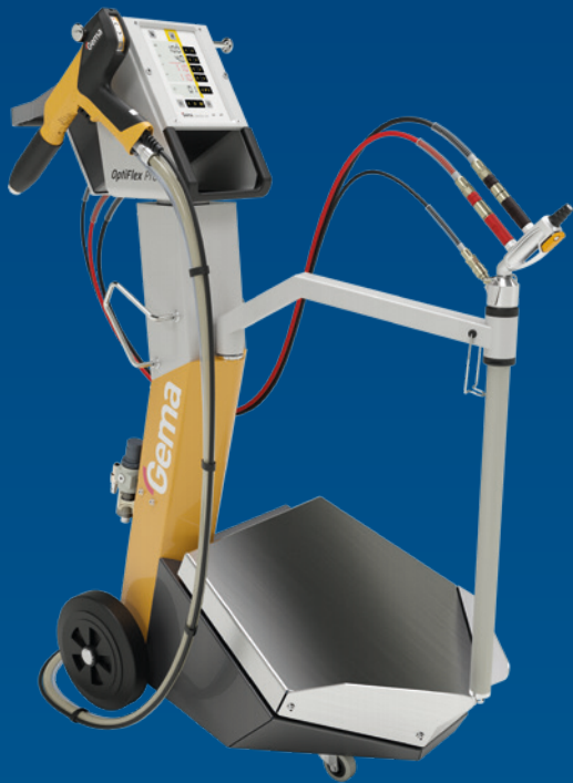
OptiFlex® Pro B