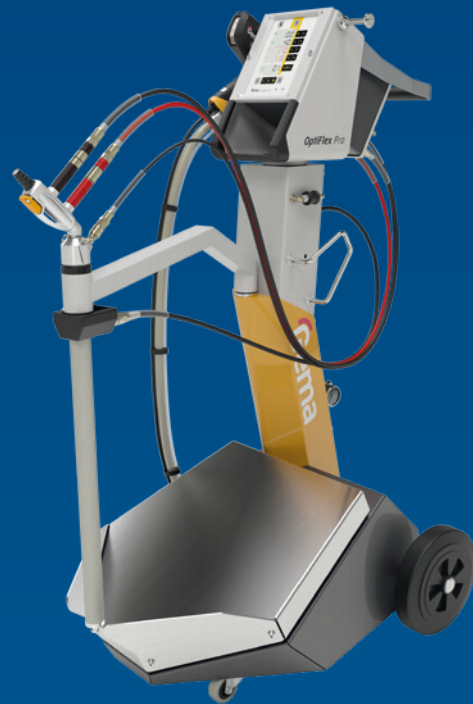
OptiFlex® Pro Q