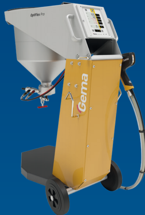
OptiFlex® Pro S