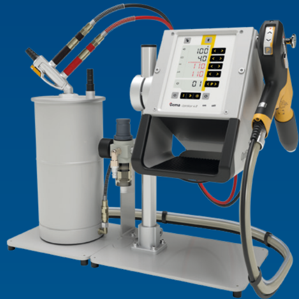
OptiFlex® Pro L