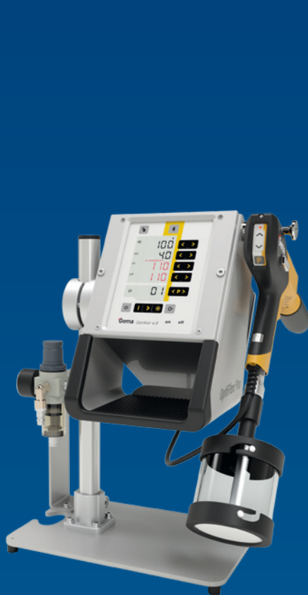
OptiFlex® Pro C