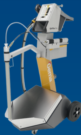
OptiFlex® Pro B Spray