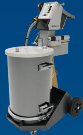
OptiFlex® Pro F Spray