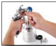
2 Slide trigger lever to release needle