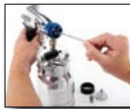
3 Pull needle out