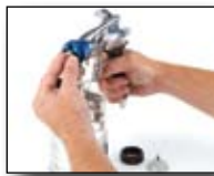
1 Remove front air cap and nozzle

Quick Needle Exchange Change needles from the front of the gun with just a click Easy to change, easy to clean with no tools needed