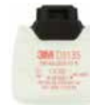
D3135 P3 R