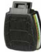
D8094 ABEK P3 R