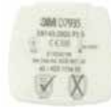
D7935 P3 R