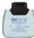
D3128 P2 R/ Nuisance* Organic Vapour & Acid Gas