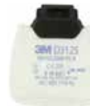
D3125 P2 R