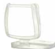
D701 Filter Retainer

HF-800 Series half mask and associated filters have an inhalation breathing resistance of less than 5 mbar, when measured at 95 lpm continuously.