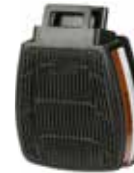
D8095 A2 P3 R