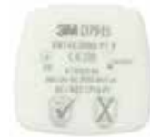
D7915 P1 R