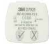
D7925 P2 R