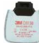
D3138 P3 R/ Nuisance* Organic Vapour & Acid Gas