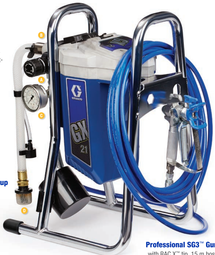
Professional SG3™ Gun with RAC X™ tip, 15 m hose