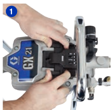
Slide & lift open access door