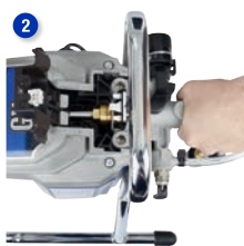
Remove pump section