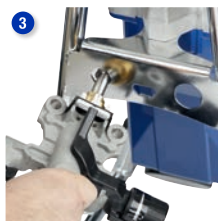
Use frame hex fitting to loosen pump and remove cartridge