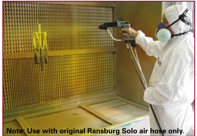
Note: Use with original Ransburg Solo air hose only.