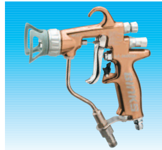
A4400M spray gun. Part no: 0909-4400-HF0000

Five year warranty on workmanship and materials on all Binks MX pumps