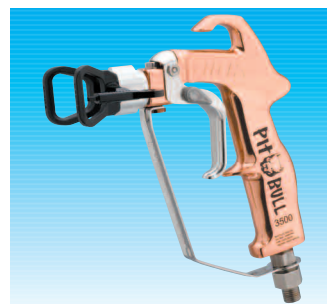
A3500 spray gun. Part no: 1108-3500-2