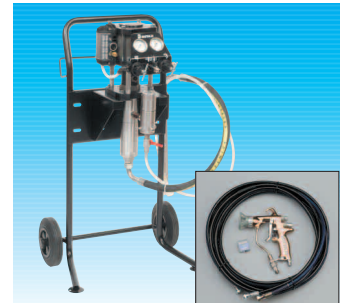
MX 12/31 12 litre per minute high volume pump