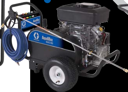
Cold Belt Drive