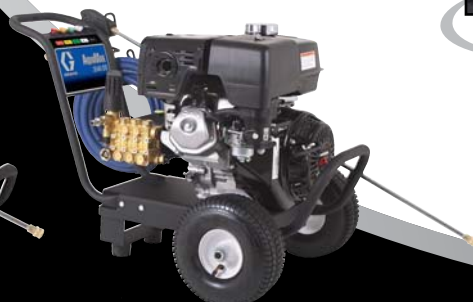
Cold Direct Drive