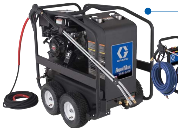
Hot Direct drive