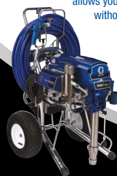
MARK V™ MAX PLATINUM