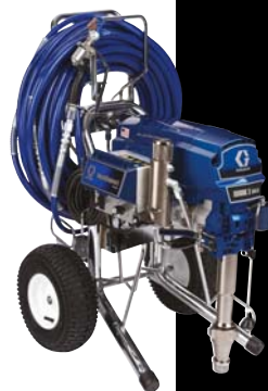
MARK X™ MAX PLATINUM

Completed with proven features like ProConnect™ easy pump exchange tool, QuikReel™ hose system, E-control wireless pressure control and FastFlush cleaning system, we are ready to continue to set the trend in compact electric airless paint and plaster sprayers. Oh, and yes, we added 15 meters of hose, totalling 30 meters, a longer whip hose and a kick stand for easy bucket change. MARK MAX Platinum series; THE standard in electric Airless