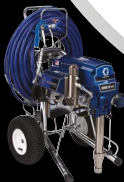
MARK VII™ MAX PLATINUM